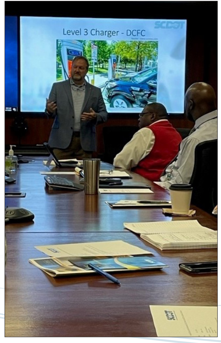
Bedenbaugh elaborates on the various charger levels which comprise NEVI.