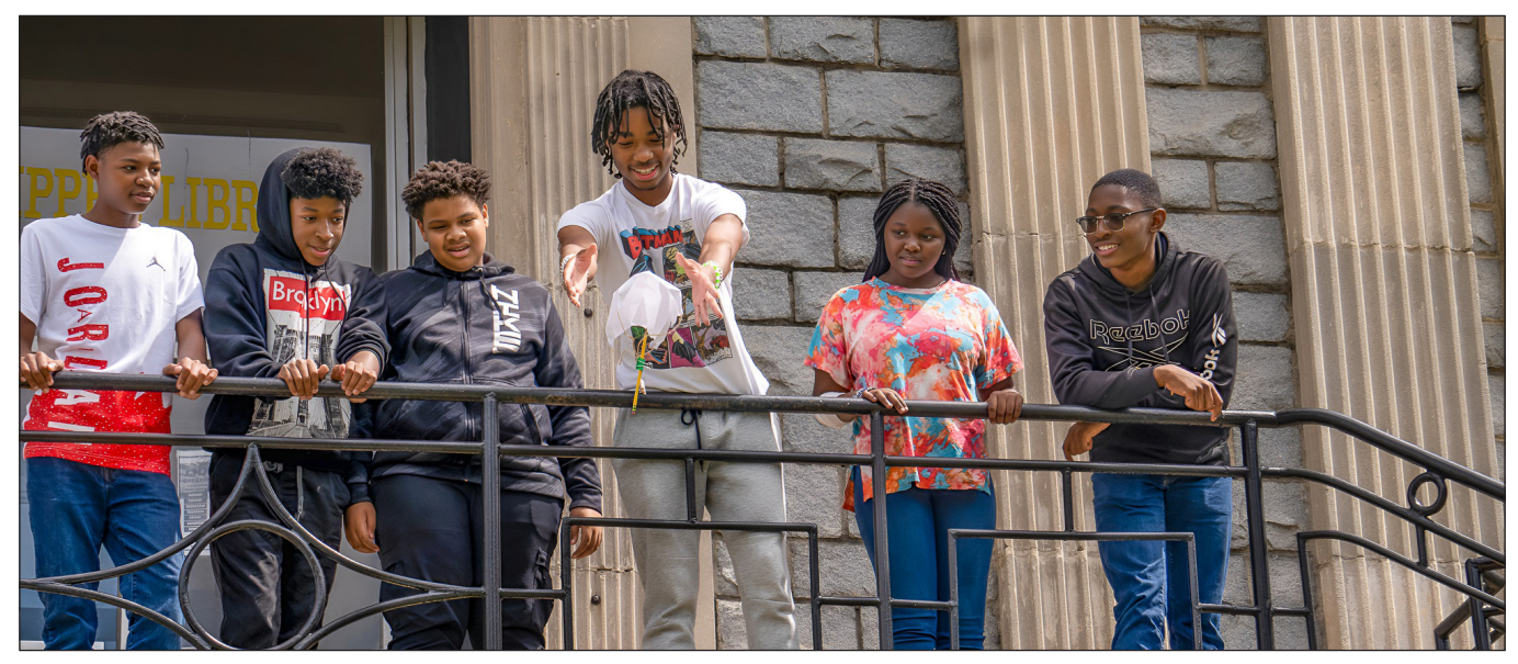
While teammates look on, a student releases their model in an attempt to replicate the team's prediction.