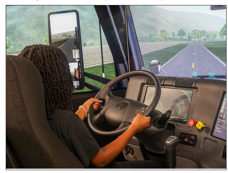
Traffic control management while behind the truck driver's wheel simulator.

The Culminating Ceremony was held on Wednesday, June 28, 2023. Students provided highlights of lessons learned while participating in the STI. The occasion was celebrated by staff, representatives from SCDOT, FHWA and parents. STI continues to serve as a mechanism that prepares our future workforce for rewarding careers in the transportation industry.